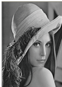
(a) Original image of Lena

10%, 35%, and 45% density impulse noises are respectively added to the original image of Lena. With VC++6.0, results of the comparative experiment are shown as Fig. 1.